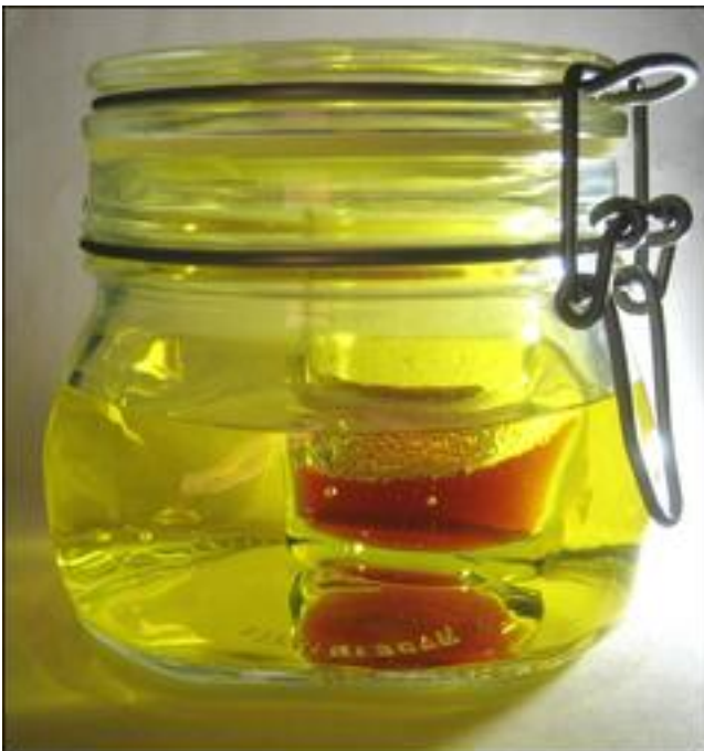
17oct'21 500ml container with 250ml water. "shot glass" with 5g SCF+5.5ml water plus 5g CAC+4.5ml water. Photo at +30 minutes.

At +3 hours 3665 ppm, 3.5 pH, 97 TDS, 39% efficiency conversion of sodium chlorite to chlorine dioxide. Everything and activation at room temperature. The receiver did leak out some CLO 2 gas.