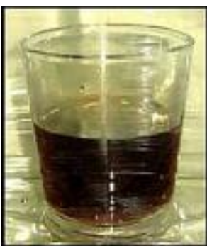
Typical reactor solution depth and color in 2012

Another important reason to use dry ingredients is that there is no question about their concentrations . We are not using them to make any specific concentrations; only using specified weights as per the recipe. The small amount of added warm water to each reactor ingredient is just enough to completely dissolve them into the water. That allows for very fast activation, which releases chlorine dioxide gas from the sodium chlorite solution. That chlorine dioxide gas then dissolves into the 250ml of CDS water. --CL